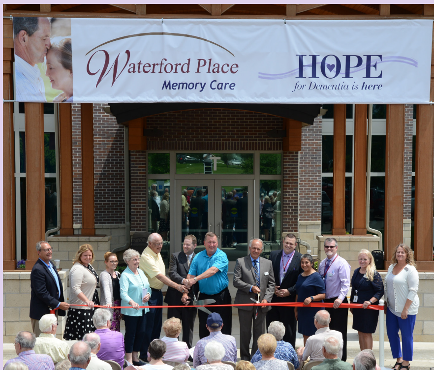
Memory Care Grand Opening Ribbon Cutting Ceremony