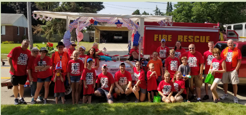
4th of July Parade