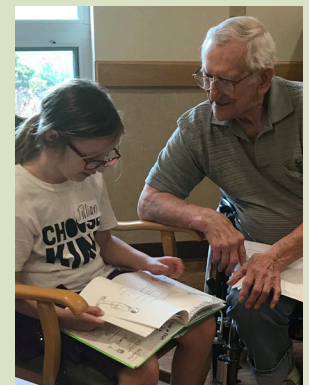
Grandville Public School Volunteers