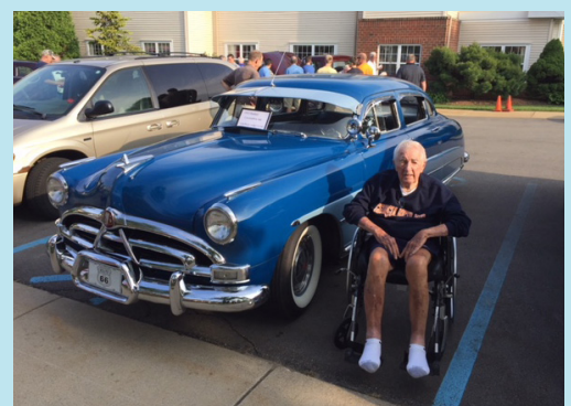
Celebrating Father's Day