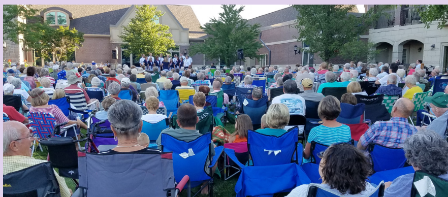
Cookout & Concert