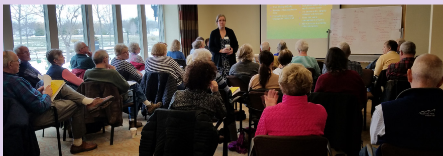
Savvy Caregiver & Understanding Dementia Classes